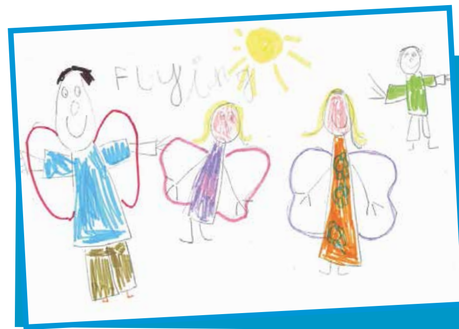
'My dream way of travelling to school' competition 2012. Overall winner Sophie, aged 5