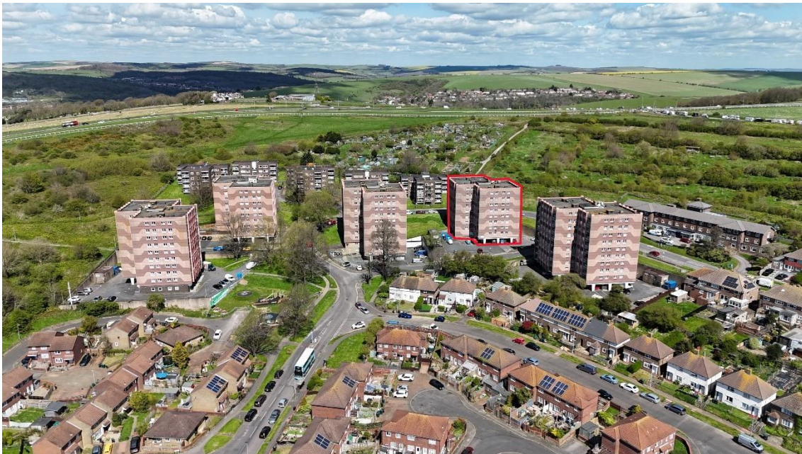
Figure 1: Aerial Image of North Whitehawk Buildings Indicating Heron Court Location

Above the reinforced concrete podium, the construction of the remaining eight upper floor levels comprises of Large Panel System (LPS) construction, consisting of precast floor and wall panels. The internal core, containing two lift shafts, stairs and risers is also constructed of a precast panel construction. All the buildings within the Whitehawk Estate are estimated to have been constructed circa 1965 and are believed to be of Wates LPS design.