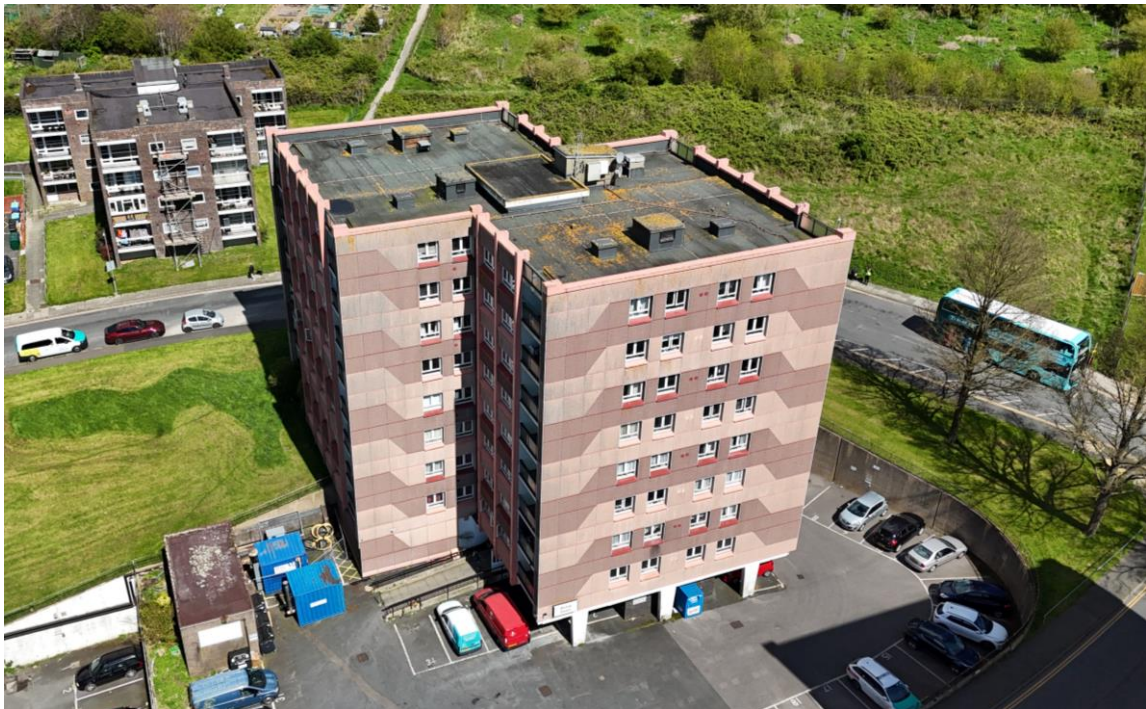
Figure 3: Aerial Image of Heron Court

By review of British Geological Society mapping data, it is understood that the site is underlain by Seaford Chalk Formation, comprising of Chalk. It is anticipated, given the bearing strata, construction, and form that the structure will be supported on piled foundations.