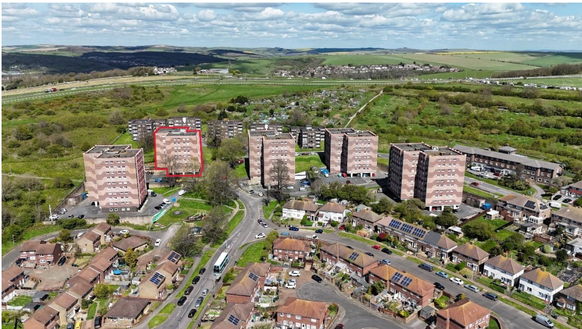
Figure 1: Aerial Image of North Whitehawk Buildings Indicating Kingfisher Court Location

Above the reinforced concrete podium, the construction of the remaining eight upper floor levels comprised of Large Panel System (LPS) construction, consisting of precast floor and wall panels. The internal core, containing two lift shafts, stairs and risers is also constructed of a precast panel construction. All the buildings within the Whitehawk Estate are estimated to have been constructed circa 1965 and are believed to be of Wates LPS design.