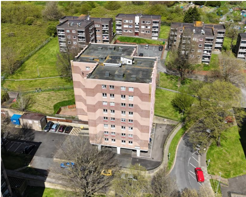
Figure 3: Aerial Image of Kingfisher Court

By review of British Geological Society mapping data, it is understood that the site is underlain by Seaford Chalk Formation, comprising of Chalk. It is anticipated, given the bearing strata, construction, and form that the structure will be supported on piled foundations.