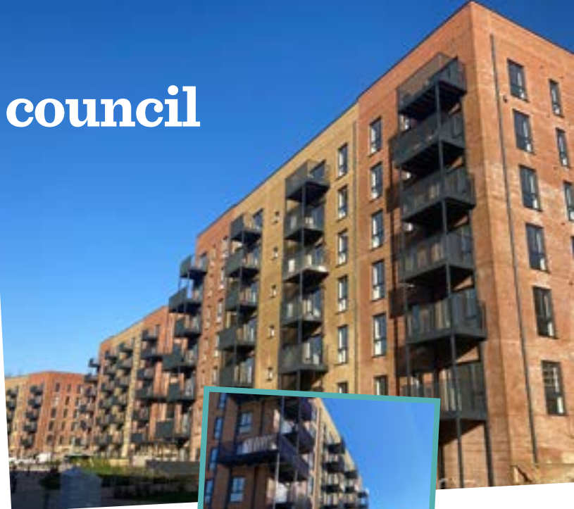
New homes at Denman Place

In addition to the council homes, there are 113 flats on the development which are shared ownership homes available through Hyde.