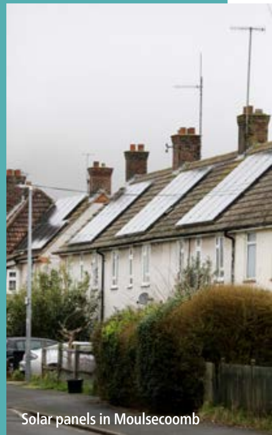
Solar panels in Moulsecomb

For more information, please email HousingSustainabilityandEnergyTeam@brighton-hove.gov.uk