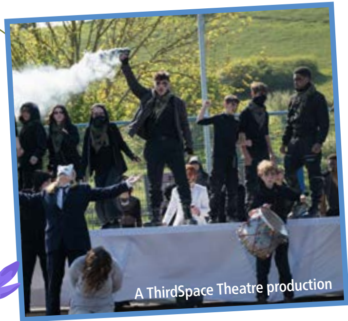
A ThirdSpace Theatre production

To find out more please get in touch with the Community Engagement Team, email edb@brighton-hove.gov.uk , call 01273 291518 or visit www.brighton-hove.gov.uk/EDB