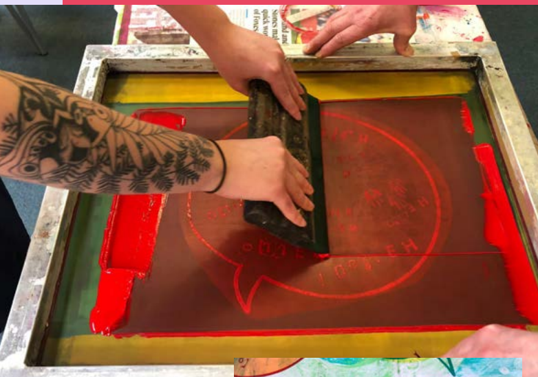
Screenprinting cushions in Moulsecocomb Library

The project, called Say Hello!, was led by arts organisation East Side Print.