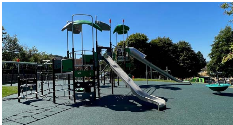
A new play and fitness area was completed in Carden Park last year

For more information, visit www.brighton-hove.gov.uk/playgrounds