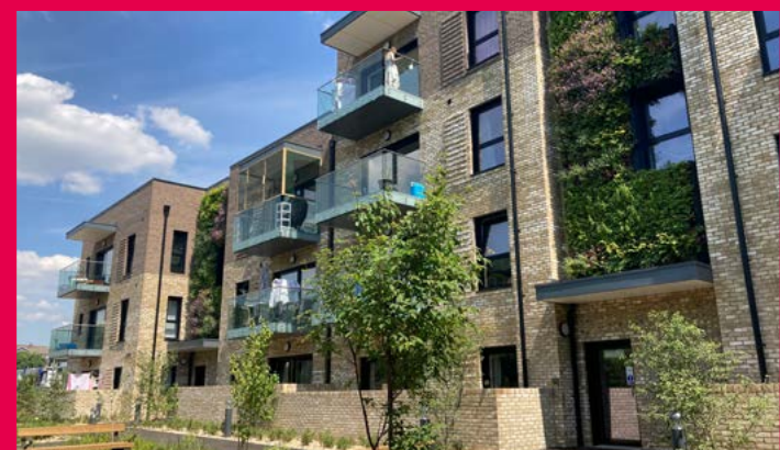
Top: New homes at Quay View