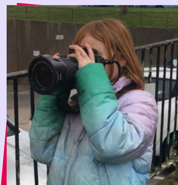
A young photographer taking part

Many of those involved want to continue taking pictures and some hope to set up a local photography club.