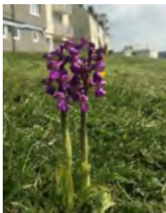
An orchid on the Bristol Estate

The idea has sprung from communications with a resident who was disappointed to see a flourishing green space near his home being cut back.