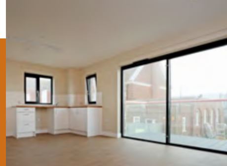
New flats in Victoria Road will benefit from solar panels

These include Rotherfield Crescent in Hollingbury where work is due to start in the spring on 3 new council houses.