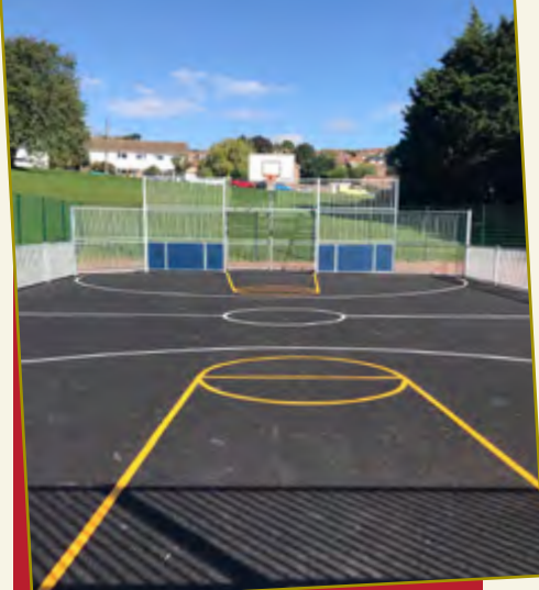
The new games area

The multi-use games area was a partnership between the council, with funding from the EDB and Environmental Improvement Budget, and The Deans Youth Project.