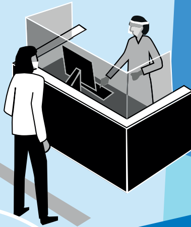
Table service is recommended where-ever possible. Where counters are used there should be a distance of 1 metre plus between staff and customers and as many other protecting factors as possible, including: