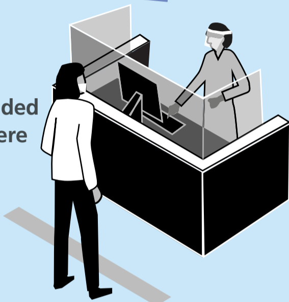
Table service is recommended where-ever possible. Where counters are used there should be a distance of 1 metre plus between staff and customers and as many other protecting factors as possible, including: