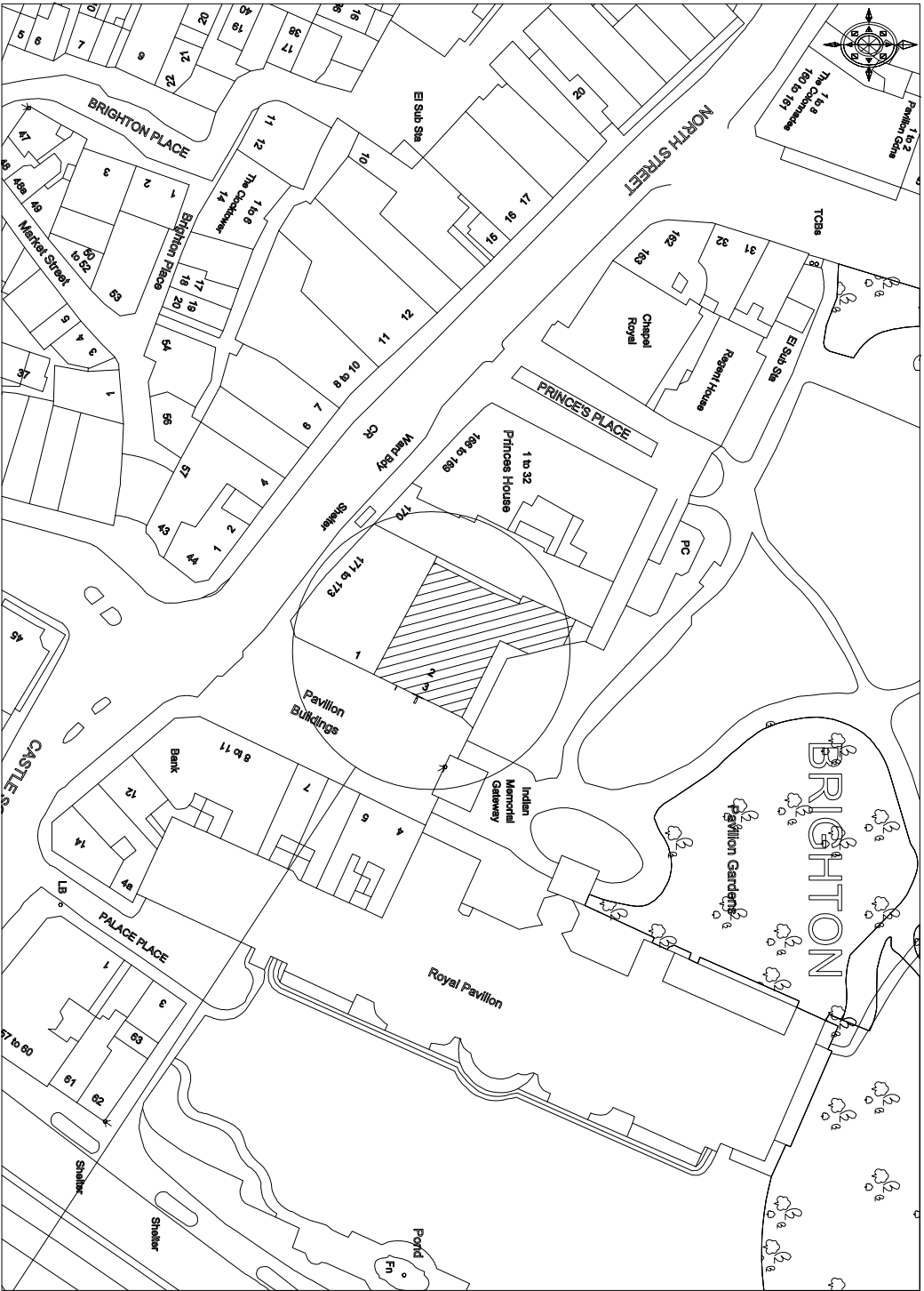
Plan view Scale 1:1250