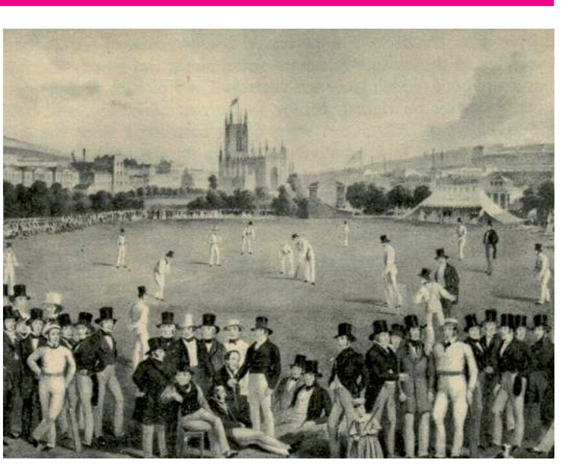
Drawing of cricket match