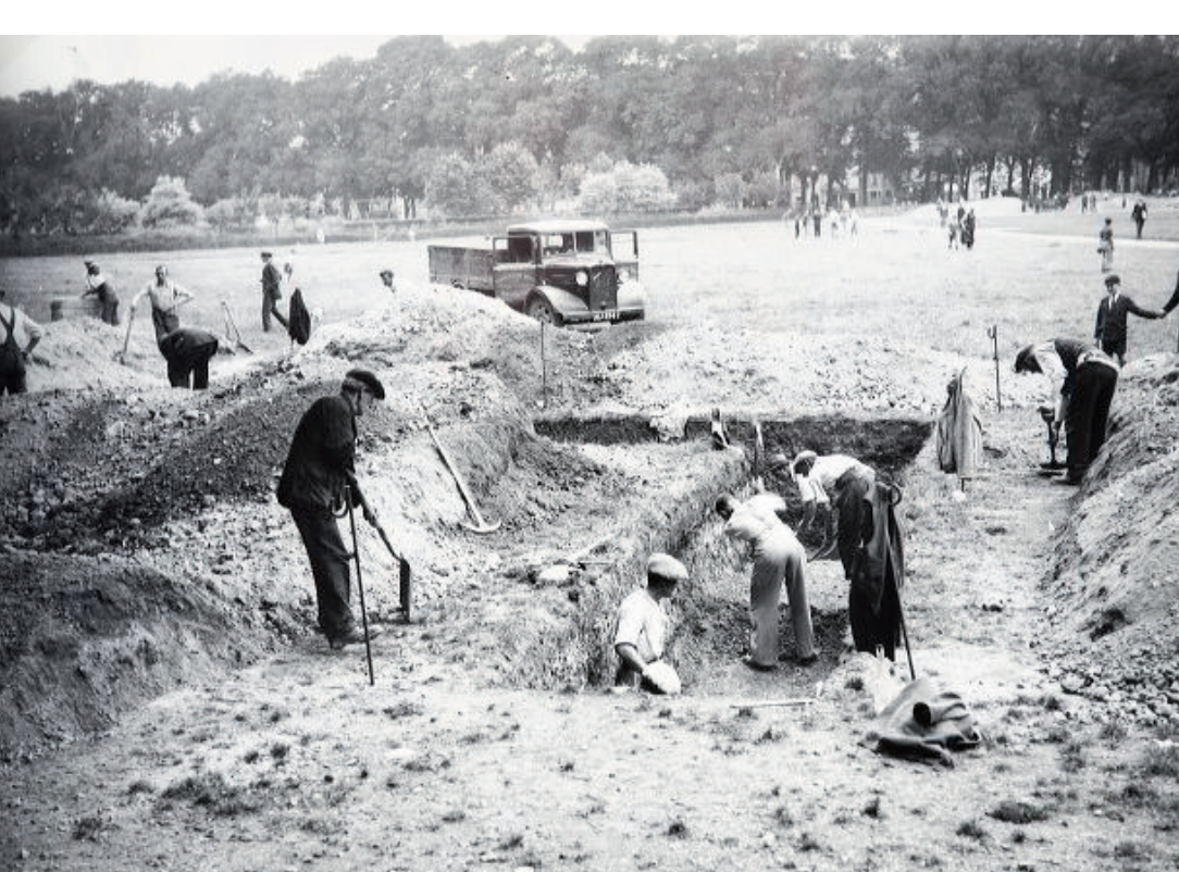
Digging trenches 1939