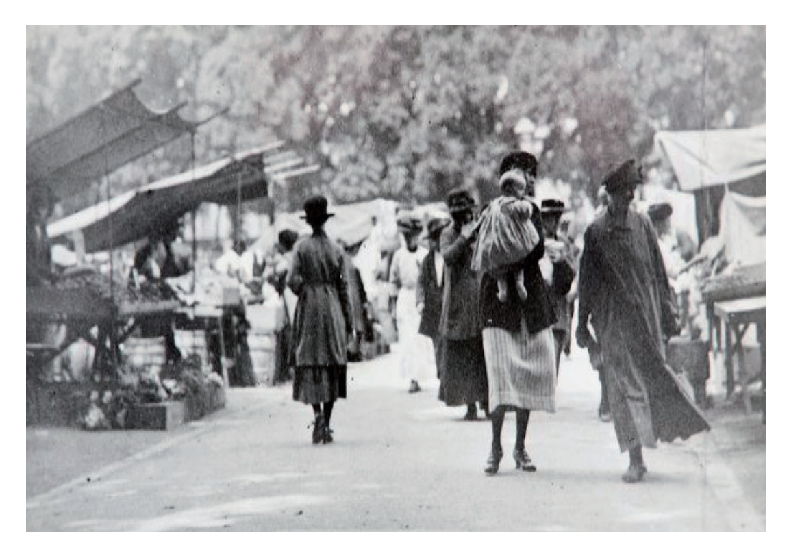
Open market on Rose Walk 1920