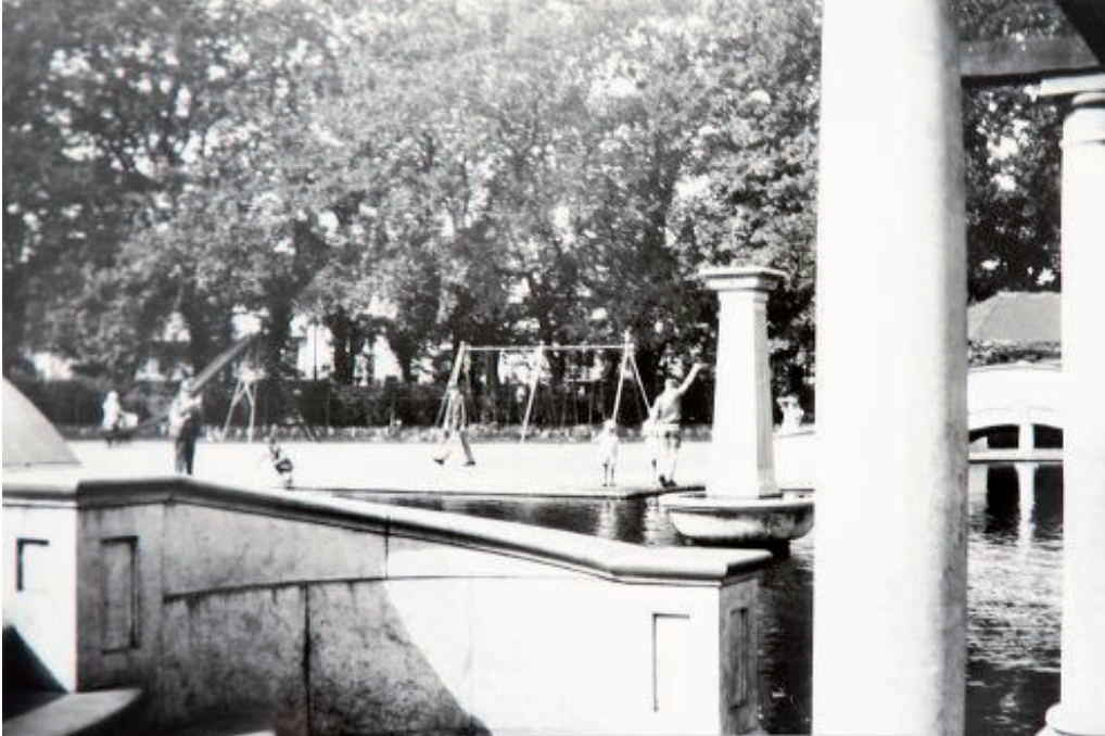
Boating lake 1923