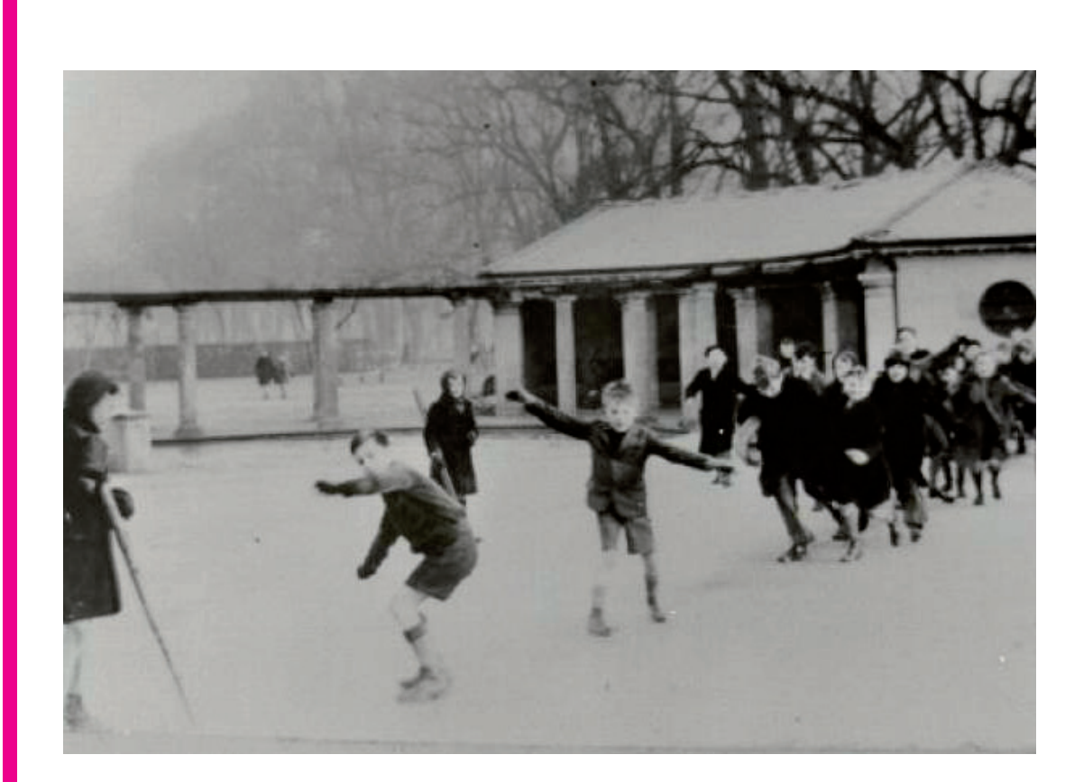
Children skating 1955