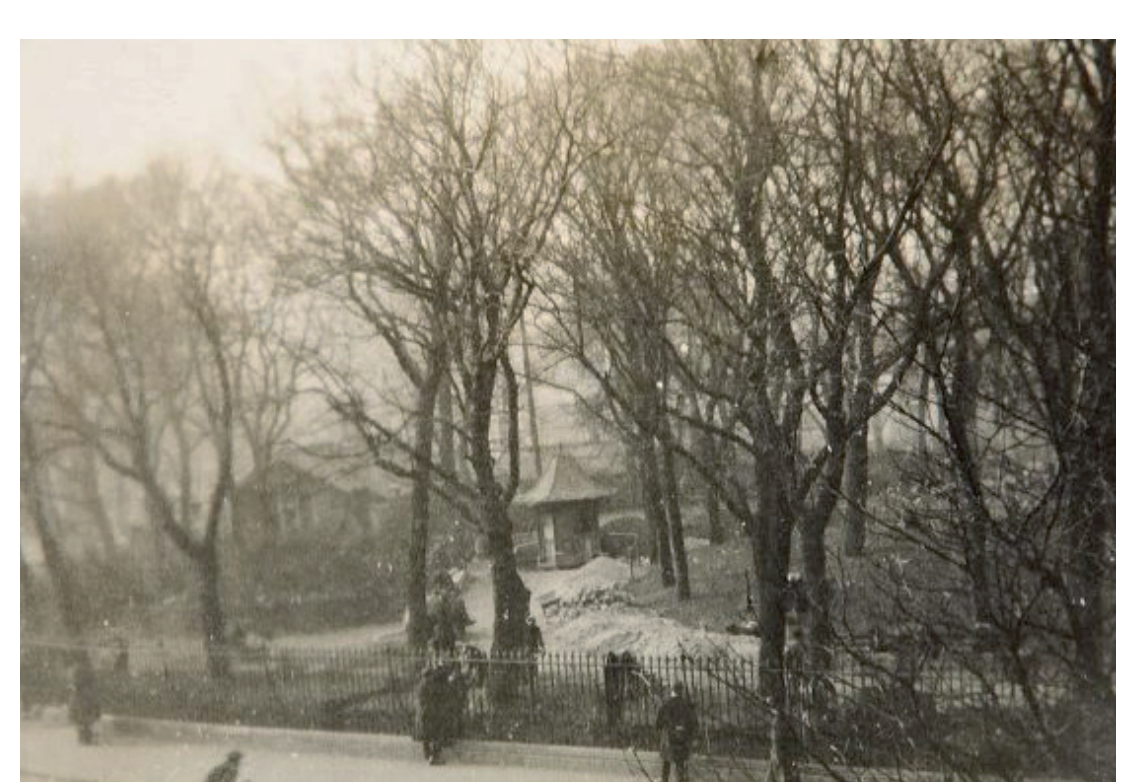
Removal of railings 1923