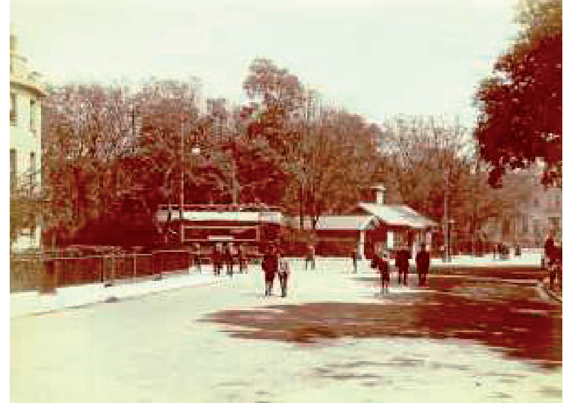
Brighton Police Station c. 1905