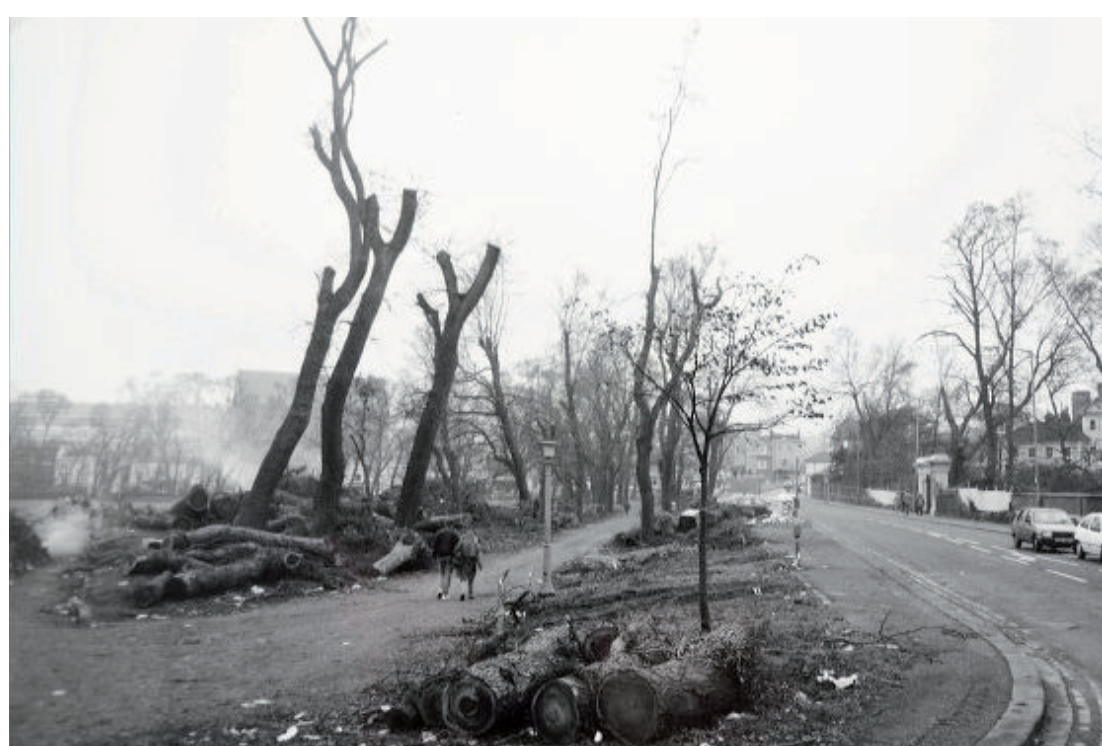
Damage from 1987 storm