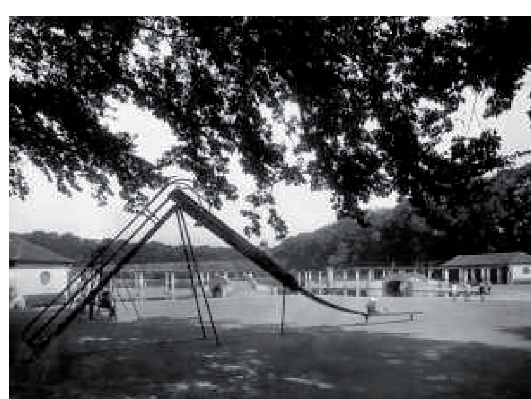
The Playground 1927