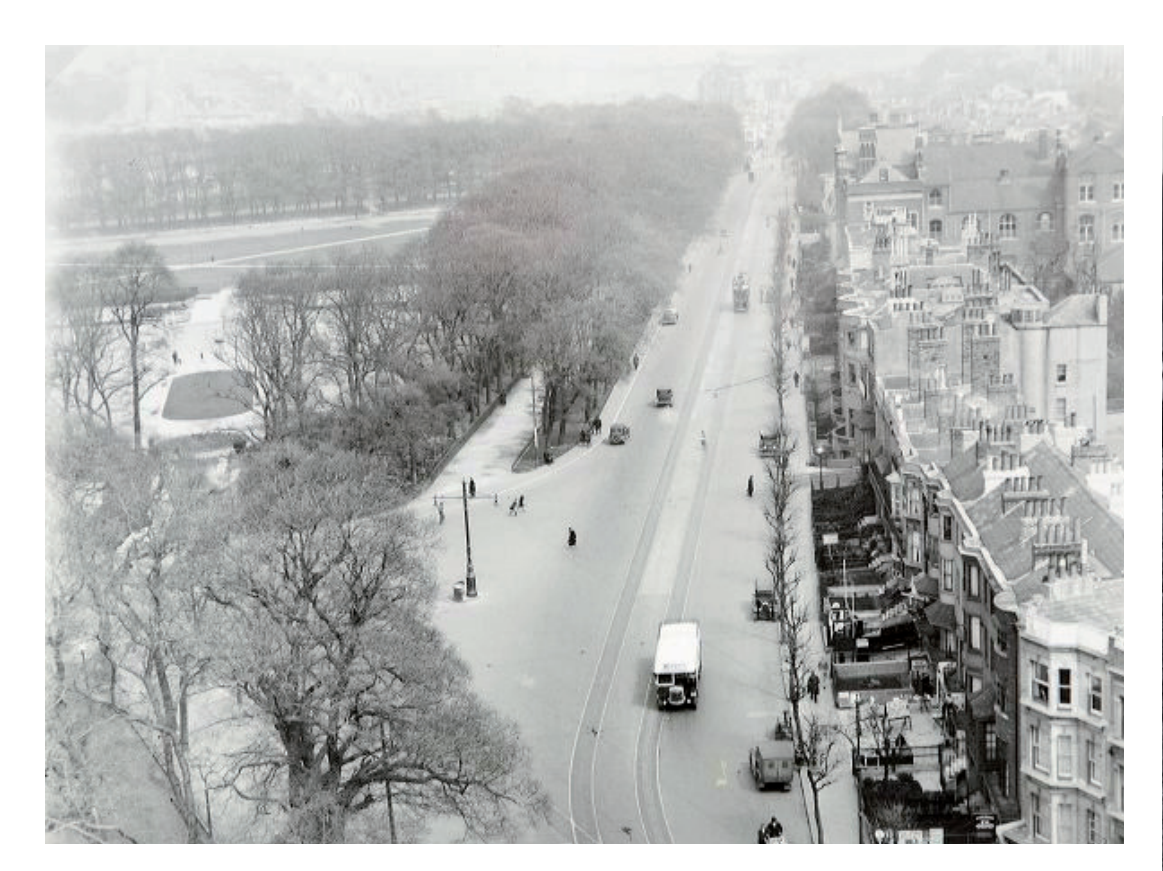
The Level 1935